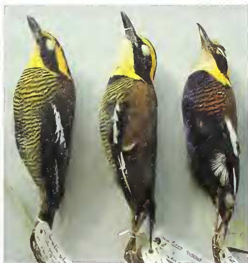
Plate 1. Banded Pitta males (lateral view): left to right, P. g. schwaneri, P. g. guajana and P. g. irena.